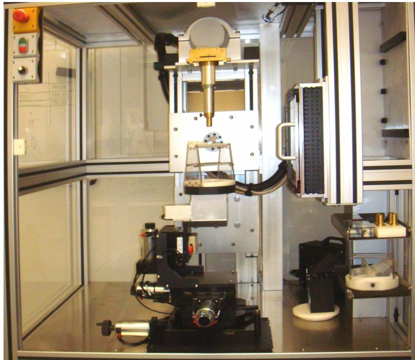
Photograph of Sarrp with the treatment head attached and the gantry in the vertical position.